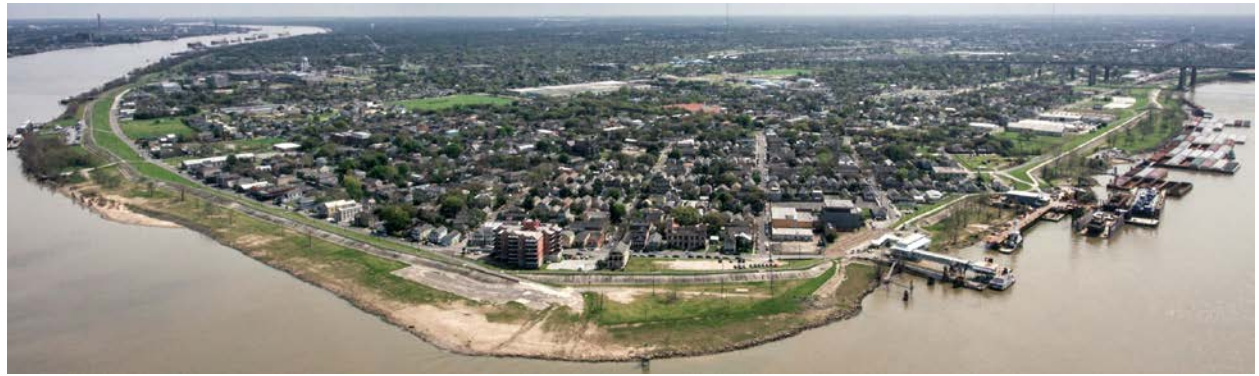
Drone photo of Algiers, March 2017