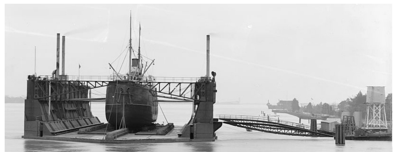
Floating dry dock for shipbuilding and repairing, an industry for which the Algiers riverfront was ideal—and for which the New Orleans riverfront on the east bank had little room. Detail of c1910s photo courtesy Library of Congress.

politicians and bureaucrats who lived there, who could hardly be counted upon to prioritize for their village-like enclave.