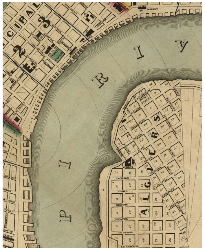
Algiers (right) in 1845, when it was an unincorporated area within Orleans Parish but outside the City of New Orleans. Detail of Norman's Map of New Orleans.

Given this mix of geographical blessings and curses, Algiers residents have long debated how best to govern themselves: by parish, by city, or by themselves?